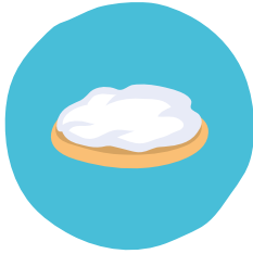
Greek-style cream cheese spread