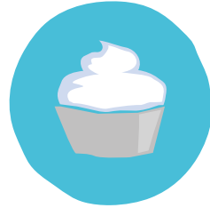
Greek-style ice cream